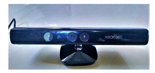
Fig.1. Xbox 360's Kinect sensor