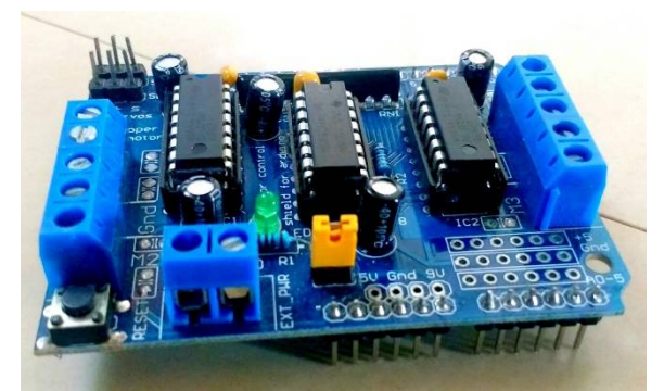
Fig.3.Adafruit Motor Shield

We have used a motor driver shield (Adafruit shield) for controlling the motors. The shield has L293D IC inbuilt. The L293 and L293D are quadruple high-current half-H drivers.